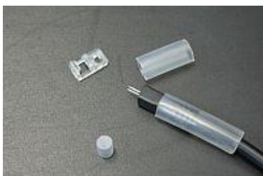
Accessories for PRI-CLE-RO/SQ-MINI.